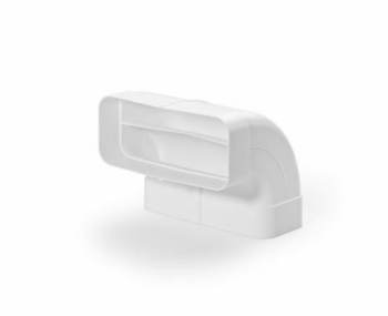
White Vertical 90° Corner connector - rectangular section 9700 535