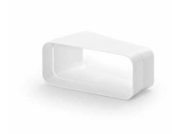
Horizontal 15° Corner connector rectangular section 9700 536