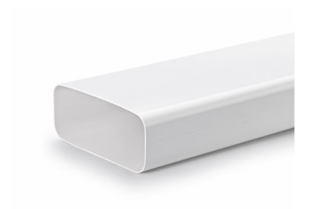
White tube - rectangular section 9700 532